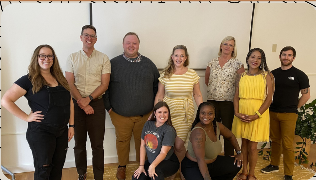
NWH+T Staff Meeting @ Tacoma McMenamins